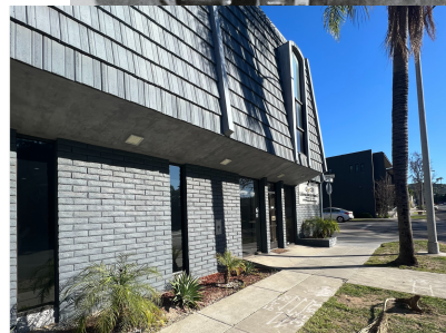
First Annual Board Meeting